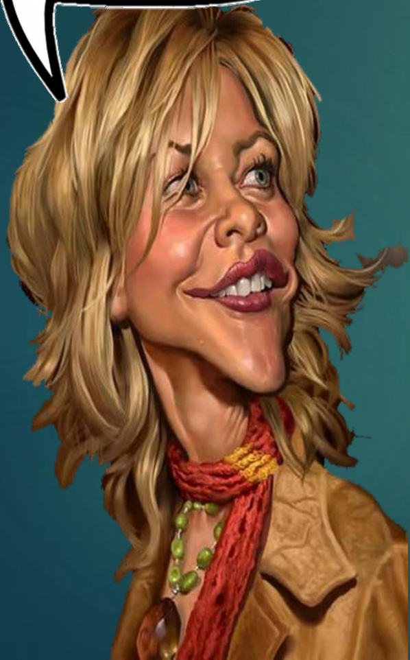
Meg F actres

Tip Number 15: Highlight one good solid skill or accomplishment!